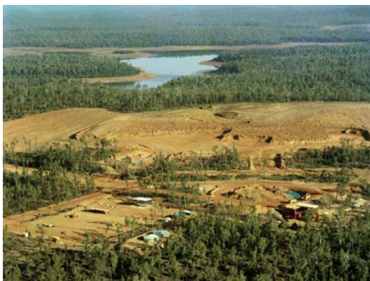
Bauxite mining site before rehabilitation

Recycled aluminium billets are used 100% of the time at Kawneer. Because aluminium does not rust, decay, or lose its quality, it can be recycled repeatedly without loss of properties. When recycling aluminium, it retains 95% of the energy used to originally produce it. In other words recycling aluminium only uses 5% of the energy originally used to mine, smelt and produce it.