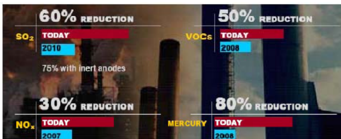
Alcoa Elimination of Waste Targets