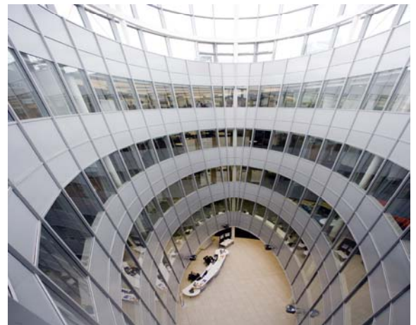
Northumbria University AA@110 Curtain Wall

Environmental Management System BS EN ISO 14001:2004 for the sales, design, manufacture and supply of aluminium architectural products