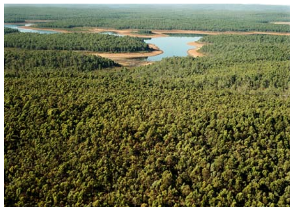
Bauxite mining site after rehabilitation

For further information on Kawneer or any of our products visit our website at www.Kawneer.co.uk or contact our head office at Runcorn