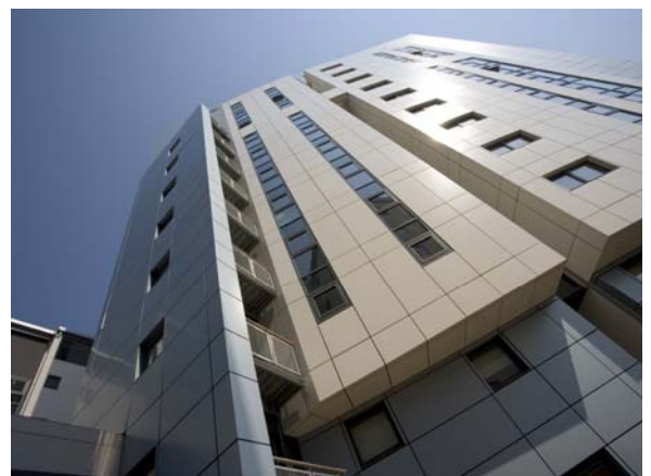
Glasgow Harbour AA@603 Tiltturn Windows, AA@603 Tilt Slide Doors

For further information on Kawneer or any of our products visit our website at www.Kawneer.co.uk or contact our head office at Runcorn